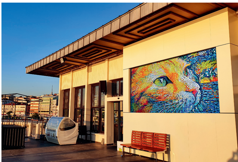
KADIKOY PIER BOOK CAFE ISTANBUL / TURKEY